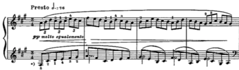
Ex. 31 Medtner, Fairy Tale Op. 51, No. 5 , mm. 1-4

In the introduction (mm. 1-26), the up-and-down, two-against-three figures and hemiolas depict the many suitors' attempts, and the difficulty of climbing up, struggling, and then falling down (off-beats).