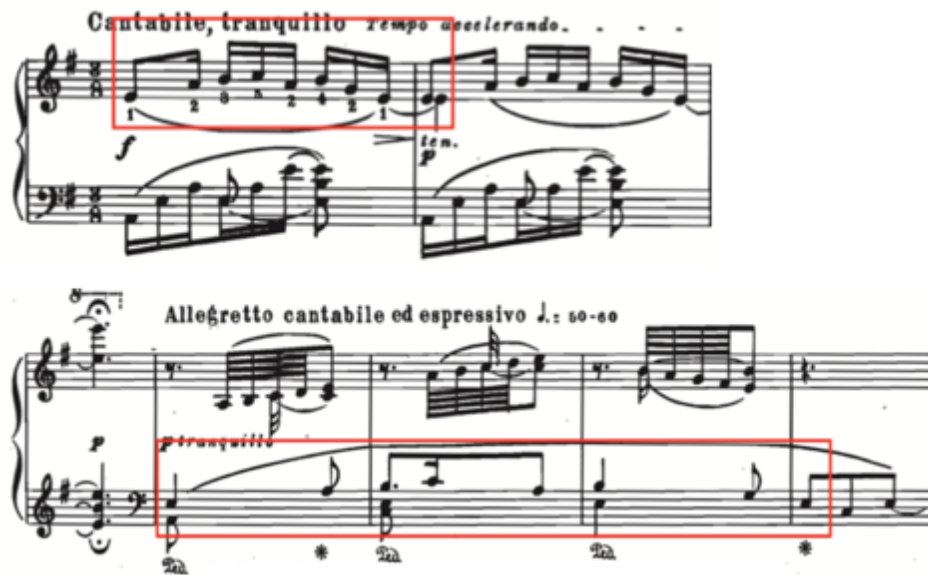
Ex. 15 Medtner, Fairy Tale Op. 51, No. 2 , mm. 1-2 and mm. 13-16

This thematic material shares the notes E–C–A with Tale No. 1 (m. 17, “the Great Russian version”). 55