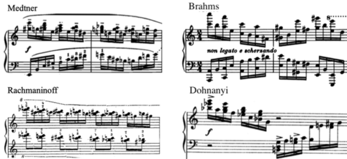
Ex. 27 Medtner, Fairy Tale Op. 51, No. 3 , compared to Brahms, Dohnányi, and Rachmaninoff

The recapitulation (mm. 98-127) returns to the dreamy “Cinderella theme” in A major with arpeggiated accompaniment, evoking her contentment. The lyrical prince theme suggests he is with Cinderella (mm. 120-127), and leads to the coda, where the prince takes her on his horse and rides away. The last four measures, Andante , derive from the first theme, as the story comes to a happy end.