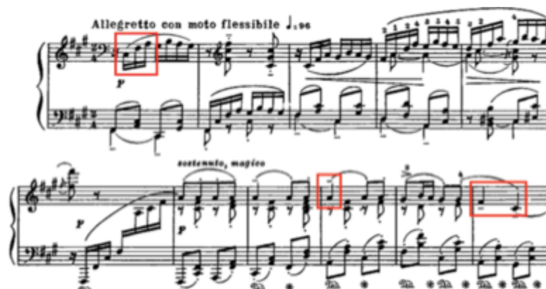
Ex. 28 Medtner, Fairy Tale Op. 51, No. 4 , mm. 1-11

The somber first theme ( magico ) appears in different voices, describing the three brothers' discussion about visiting their father's grave (mm. 7-30). The two older brothers, being lazy or afraid, force their younger sibling, Ivan, to go to the grave in their stead. This theme contains many folkloristic traits, including ten repeated notes, a limited range, and no leaps larger than a 4 th . Each phrase has five measures, and ends with F-sharp–C-sharp, first in quarters, then in 8 ths .