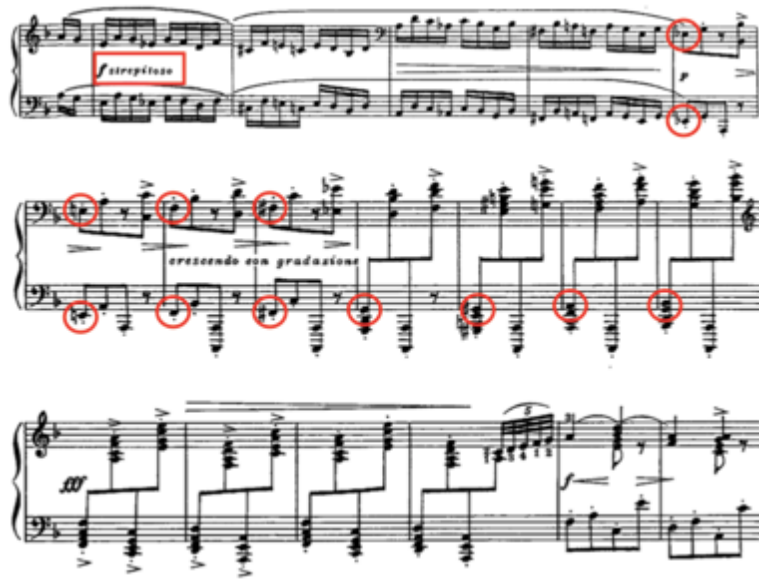
Ex. 11 Medtner, Fairy Tale Op. 51, No. 1 , mm. 246-262

When A' returns in m. 262 with the main theme, the rhythm is presented in augmentation (quarters), and then ornamented.