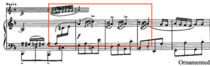
Ex. 12b Medtner, Fairy Tale Op. 51, No. 1 , mm. 270-273

The melody in mm. 280-281 recalls Rachmaninoff's Piano Concerto No. 3 in D minor, Op. 30 , composed in 1909.