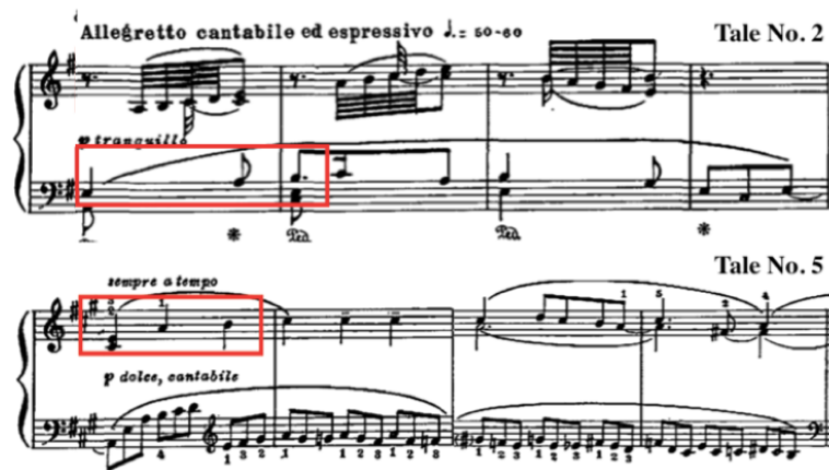
Ex. 35 Medtner, Fairy Tales Op. 51, Nos. 2 and 5

Ivan jumps thrice to reach to the princess with the magic horse's help (mm. 75-87). On his third attempt, with a big leap he finally reaches and kisses the princess (mm. 83-86), and she stamps a star mark on his forehead with her seal-ring (m. 87).