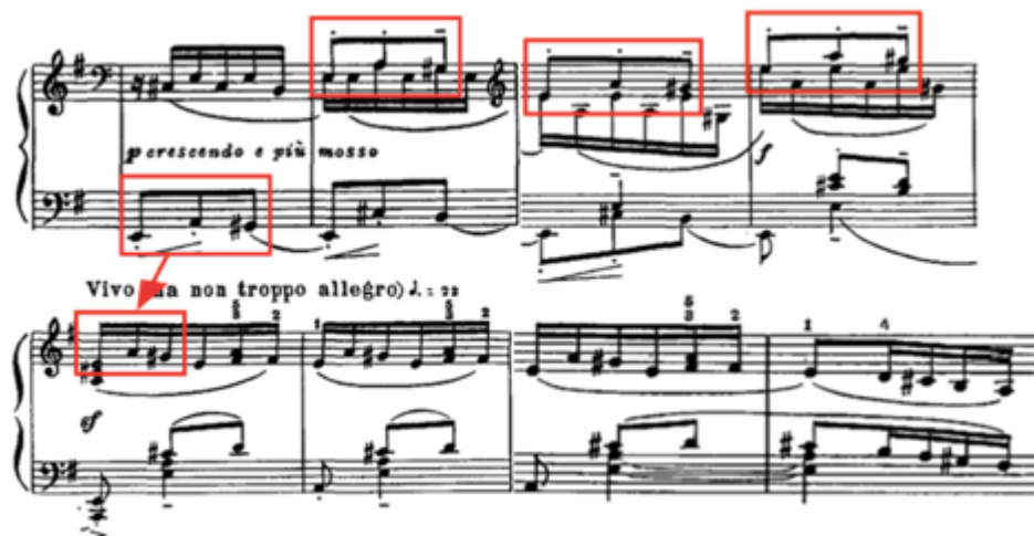
Ex. 18 Medtner, Fairy Tale Op. 51, No. 2 , mm. 65-72

In the transition (mm. 47-68), the siciliano melody continues in C major but the right-hand's accompaniment has a different figuration, developing a delightful dance-like rhythm that prepares the next part. Cinderella is becoming excited, dressing up for the royal ball at the palace with the Fairy Godmother's help, as the music whirls più vivo and più mosso towards B , in A major (mm 55-68). The "Cinderella theme" keeps appearing in the left hand, while the right hand figuration changes from 64 th notes to 16 th notes, as the siciliano gradually becomes a waltz. The E–A–G-sharp figure in m. 65 piles up from the lower to the upper register (mm. 65-68), leading to its diminution in 16 ths , as the B section begins.