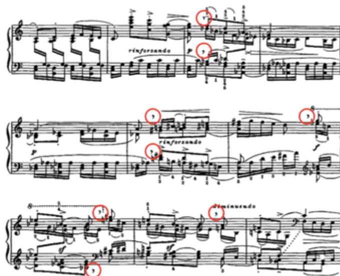
Ex. 24 Medtner, Fairy Tale Op. 51, No. 3 , mm. 67-76

The prince stops for a rest, thinking of Cinderella with a lyrical melody at m. 54, and resumes his quest in the development (mm. 65-97), which starts with the second theme in C major. The prince arrives at Cinderella's house (m. 68), where the two sisters try hard to fit into the slipper (mm. 72-75), their efforts shown by the many breath marks between sequences.