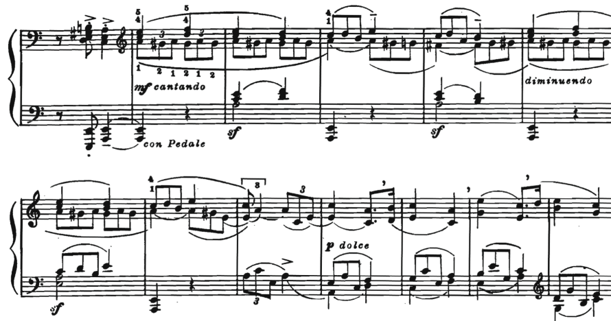
Ex. 7 Medtner, Fairy Tale Op. 51, No. 1 , mm. 111-123

C (mm. 112-261) starts with gloomy melodies in A minor that invoke Cinderella's doleful predicament, and develops materials from the introduction and A with new ideas. These seem completely different, but are actually rhythmically derived from the previous part.