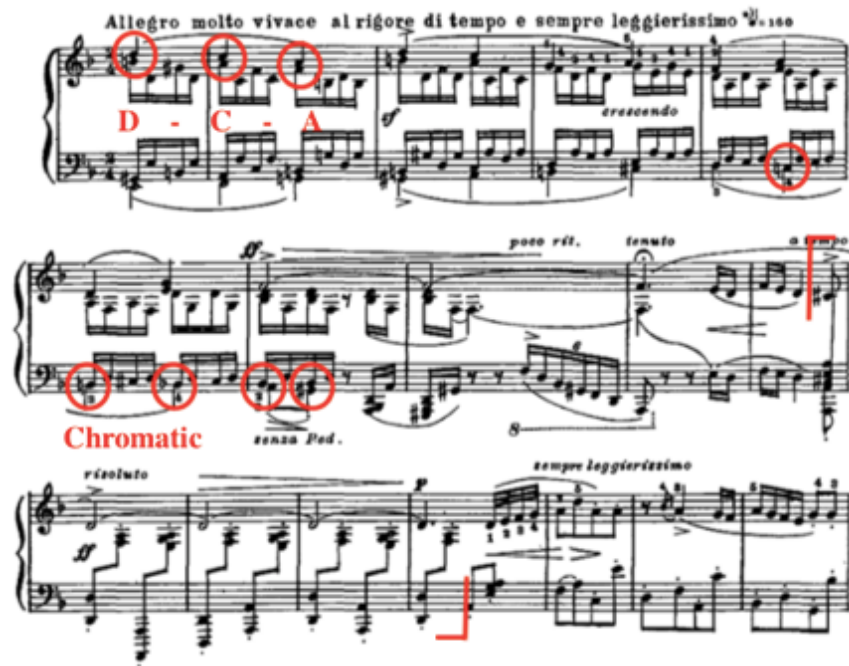
Ex. 1 Medtner, Fairy Tale Op. 51, No. 1 , mm. 1-16

The A section starts with a folk melody in m. 14. The material (D–C–A) from the introduction is used for the first (A–D, m. 14) and second (A–C, m. 22) themes. This naïve-sounding theme introducing Ivan contains traits of Russian folk music, such as limited range, few skips larger than a 4 th , stepwise rising 3 rds , and extended repetition of a single pitch. 53 These features are found throughout the tale.