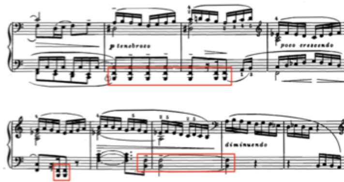
Ex. 25 Medtner, Fairy Tale Op. 51, No. 3 , mm. 77-85

He sprints away to continue his search (m. 86), but turns around, having caught a glimpse of Cinderella hiding by the fireplace. The two sisters protest, and try to prevent him from reaching her ( Strepitoso at mm. 90-93), but he prevails, tries the glass slipper on Cinderella, and it fits perfectly (return to A major in mm. 96-97).