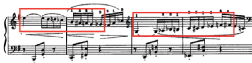
Ex. 41b Medtner, Fairy Tale Op. 51, No. 6 , mm. 149-152