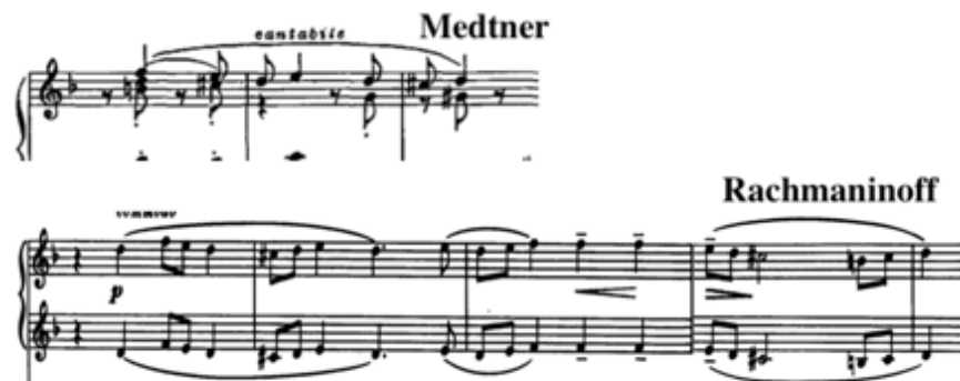
Ex. 13 Medtner, Fairy Tale Op. 51, No. 1 ; Rachmaninoff, Piano Concerto No. 3, Op. 30/I

The melody in mm. 280-281 recalls Rachmaninoff's Piano Concerto No. 3 in D minor, Op. 30 , composed in 1909.