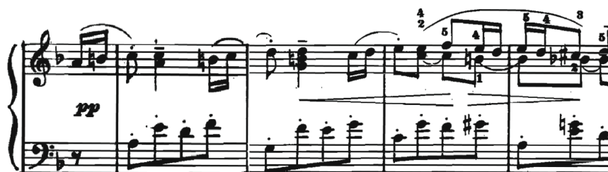
Ex. 4 Medtner, Fairy Tale Op. 51, No. 1 , mm. 22-25

The second theme at m. 22 depicts Ivan’s dance, due to its dance-like melody with tenuto weak beats.