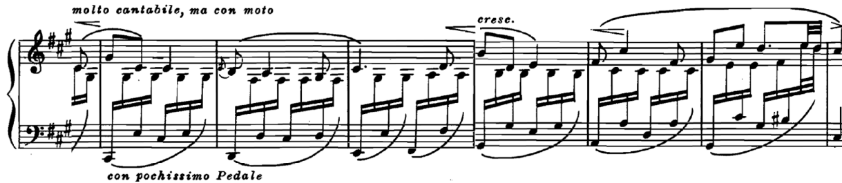
Ex. 30 Medtner, Fairy Tale Op. 51, No. 4 , mm. 38-43

The second theme, molto cantabile in C-sharp minor, evokes Ivan's grief for his dead father, as he sits and waits until his father rises from the grave at midnight (from m. 38).