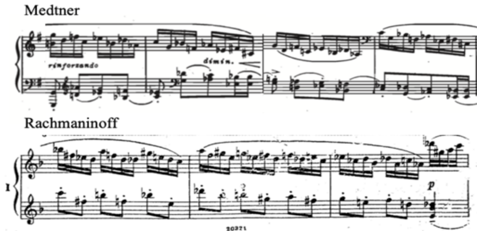
Ex. 42 Medtner, Fairy Tale Op. 51, No. 6; Rachmaninoff, Paganini Rhapsody , Op. 43

The descending figure (mm. 161-164) in the coda is curiously similar to a passage in Variation 15 from Rachmaninoff's Rhapsody on a Theme of Paganini , Op. 43 (1934).