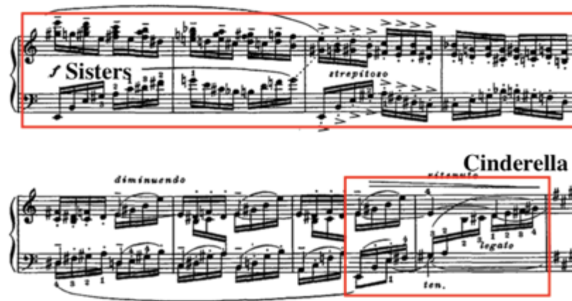
Ex. 26 Medtner, Fairy Tale Op. 51, No. 3 , mm. 90-97

He sprints away to continue his search (m. 86), but turns around, having caught a glimpse of Cinderella hiding by the fireplace. The two sisters protest, and try to prevent him from reaching her ( Strepitoso at mm. 90-93), but he prevails, tries the glass slipper on Cinderella, and it fits perfectly (return to A major in mm. 96-97).