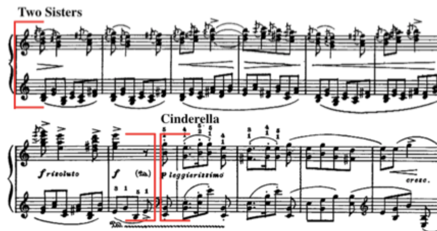
Ex. 8 Medtner, Fairy Tale Op. 51, No. 1 , mm. 124-135

The two sisters come in (mm. 124-131), and push Cinderella around, while the two-against-three rhythmic combination that was used in B reappears, with a new melody in thirds and chords. The following gentle dotted rhythm figuration illustrates Cinderella's sweeping with a broom (mm. 132-135).