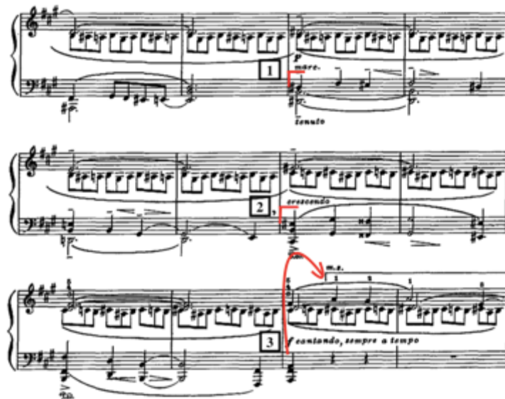
Ex. 36 Medtner, Fairy Tale Op. 51, No. 5 , mm. 73-84

Ivan jumps thrice to reach to the princess with the magic horse's help (mm. 75-87). On his third attempt, with a big leap he finally reaches and kisses the princess (mm. 83-86), and she stamps a star mark on his forehead with her seal-ring (m. 87).