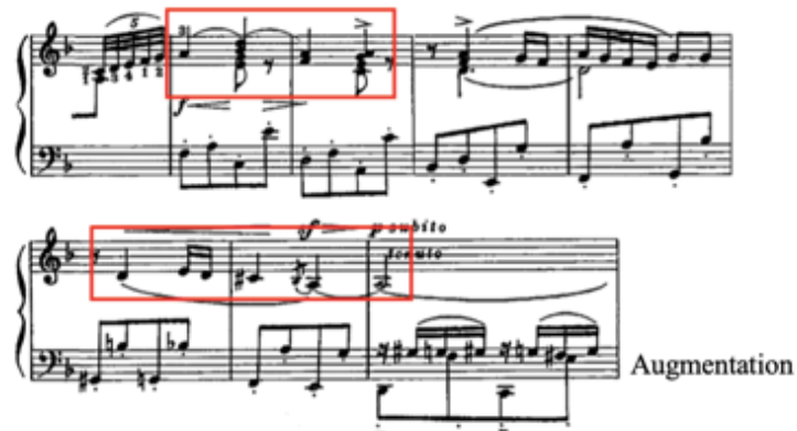
Ex. 12a Medtner, Fairy Tale Op. 51, No. 1 , mm. 262-267

When A' returns in m. 262 with the main theme, the rhythm is presented in augmentation (quarters), and then ornamented.