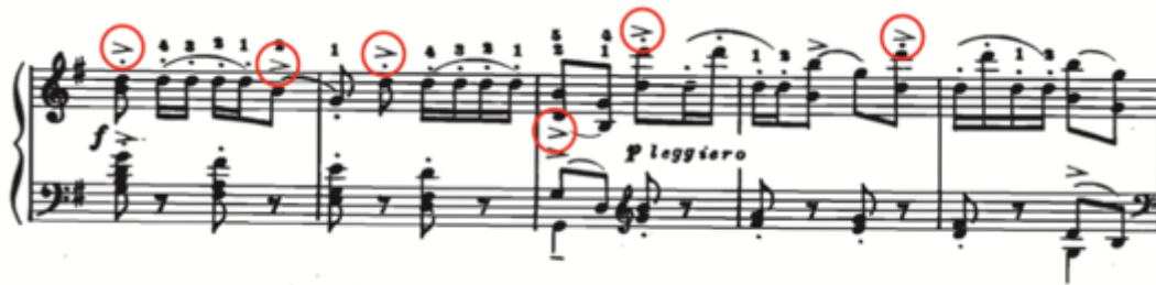
Ex. 38 Medtner, Fairy Tale Op. 51, No. 6 , mm. 5-9

The tale opens full of humor with unexpected accents, trumpet sounds signaling the commencement of the banquet (mm. 1-4). The exposition (mm. 5-65) begins with a jaunty first theme, with accents on different beats in each measure representing the dance of the happy, love-stricken Ivan.