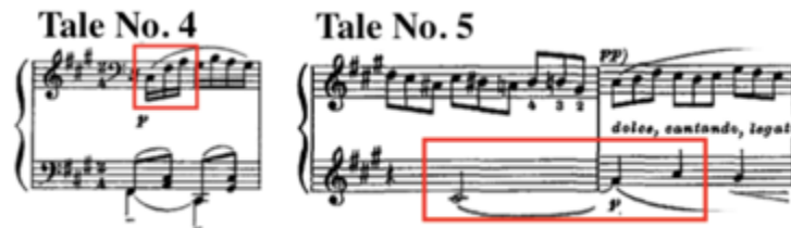
Ex. 32 Medtner, Fairy Tales Op. 51, Nos. 4 and 5

In A (mm. 29-58), the first theme enters in the left-hand, over continuing triplets from the introduction. It shares the same notes C-sharp–F-sharp–A with Tale No. 4 .