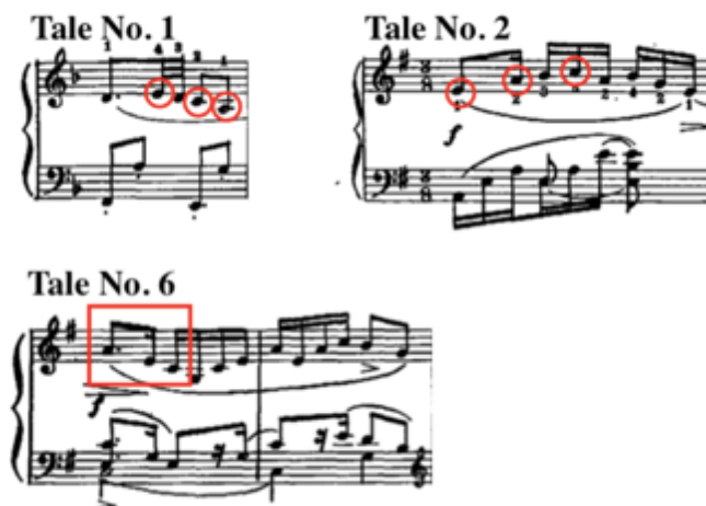
Ex. 39 Medtner, Fairy Tales Op. 51, Nos. 1, 2, and 6

The thematic material A–E–C is summoned up from previous tales.