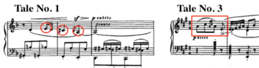
Ex. 22 Medtner, Fairy Tales Op. 51 , Nos. 1 and 3

A dreamy melody appears, as Cinderella wakes up thinking of the prince, hoping he will come to find her. This piece is similar to Tale No. 1 in terms of usage of rhythms and syncopations with accents on weak beats, and the first theme (Cinderella) summons up the notes A–C-sharp–E (Ukrainian version).