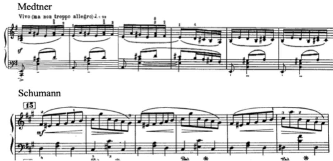
Ex. 19 Medtner, Fairy Tale Op. 51, No. 2 , mm. 69-74; Schumann, Piano Concerto, Op. 54/III

The new idea in this section is inspired by Wine Feast from Tchaikovsky's 50 Russian Folk Songs . 56 Medtner also quoted this in a later work, in the last movement of his Sonata for Violin and Piano, Op. 57, No. 3 . 57