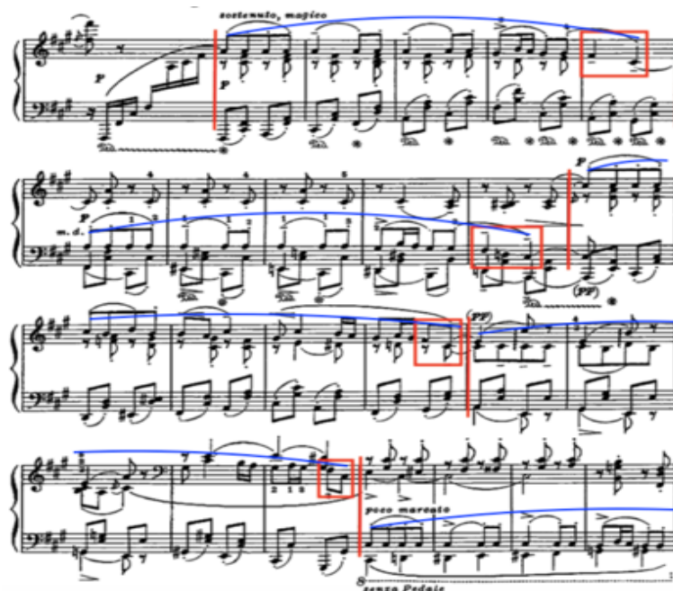
Ex. 29 Medtner, Fairy Tale Op. 51, No. 4 , mm. 6-30

The somber first theme ( magico ) appears in different voices, describing the three brothers' discussion about visiting their father's grave (mm. 7-30). The two older brothers, being lazy or afraid, force their younger sibling, Ivan, to go to the grave in their stead. This theme contains many folkloristic traits, including ten repeated notes, a limited range, and no leaps larger than a 4 th . Each phrase has five measures, and ends with F-sharp–C-sharp, first in quarters, then in 8 ths .