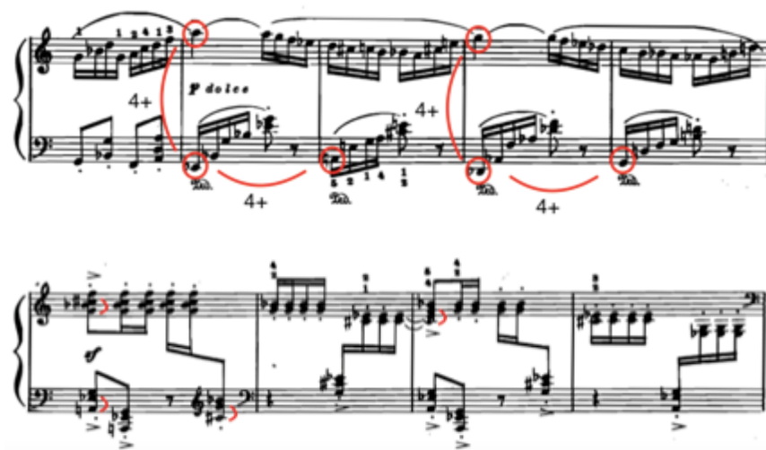
Ex. 41a Medtner, Fairy Tale Op. 51, No. 6 , mm. 91-94 and 99-102