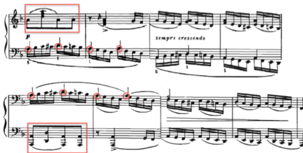
Ex. 14 Medtner, Fairy Tale Op. 51, No. 1 , mm. 305-312

A coda closes the piece with running notes that give sense of what will follow, as a similar figuration is used in No. 2.