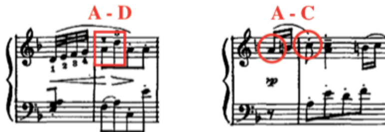
Ex. 2 Medtner, Fairy Tale Op. 51, No. 1 , m. 14 and m. 22

The A section starts with a folk melody in m. 14. The material (D–C–A) from the introduction is used for the first (A–D, m. 14) and second (A–C, m. 22) themes. This naïve-sounding theme introducing Ivan contains traits of Russian folk music, such as limited range, few skips larger than a 4 th , stepwise rising 3 rds , and extended repetition of a single pitch. 53 These features are found throughout the tale.