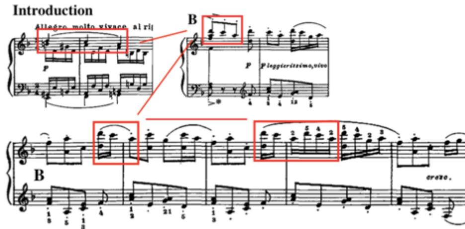
Ex. 6 Medtner, Fairy Tale Op. 51, No. 1 , Introduction and mm. 64-70

B (mm. 64-111) has a dance-like character, with the material from the introduction in diminution: quarter notes → 8 th notes → 16 th notes (mm. 64-69).