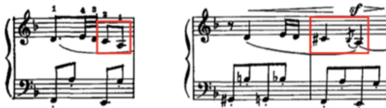
Ex. 3 Medtner, Fairy Tale Op. 51, No. 1 , m. 17 - Great Russian and Ukrainian versions

According to Yasser, the phrase ending of this first theme (C–A) is “in the Great Russian version,” and when repeated in A', it is in the Ukrainian version, with the interval of augmented second (C-sharp–B-flat–A). 54