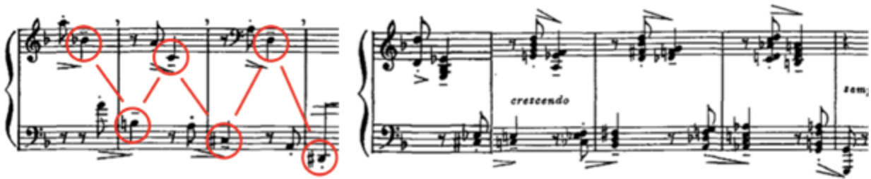
Ex. 5 Medtner, Fairy Tale Op. 51, No. 1 , mm. 35-38 and mm. 56-59

B (mm. 64-111) has a dance-like character, with the material from the introduction in diminution: quarter notes → 8 th notes → 16 th notes (mm. 64-69).